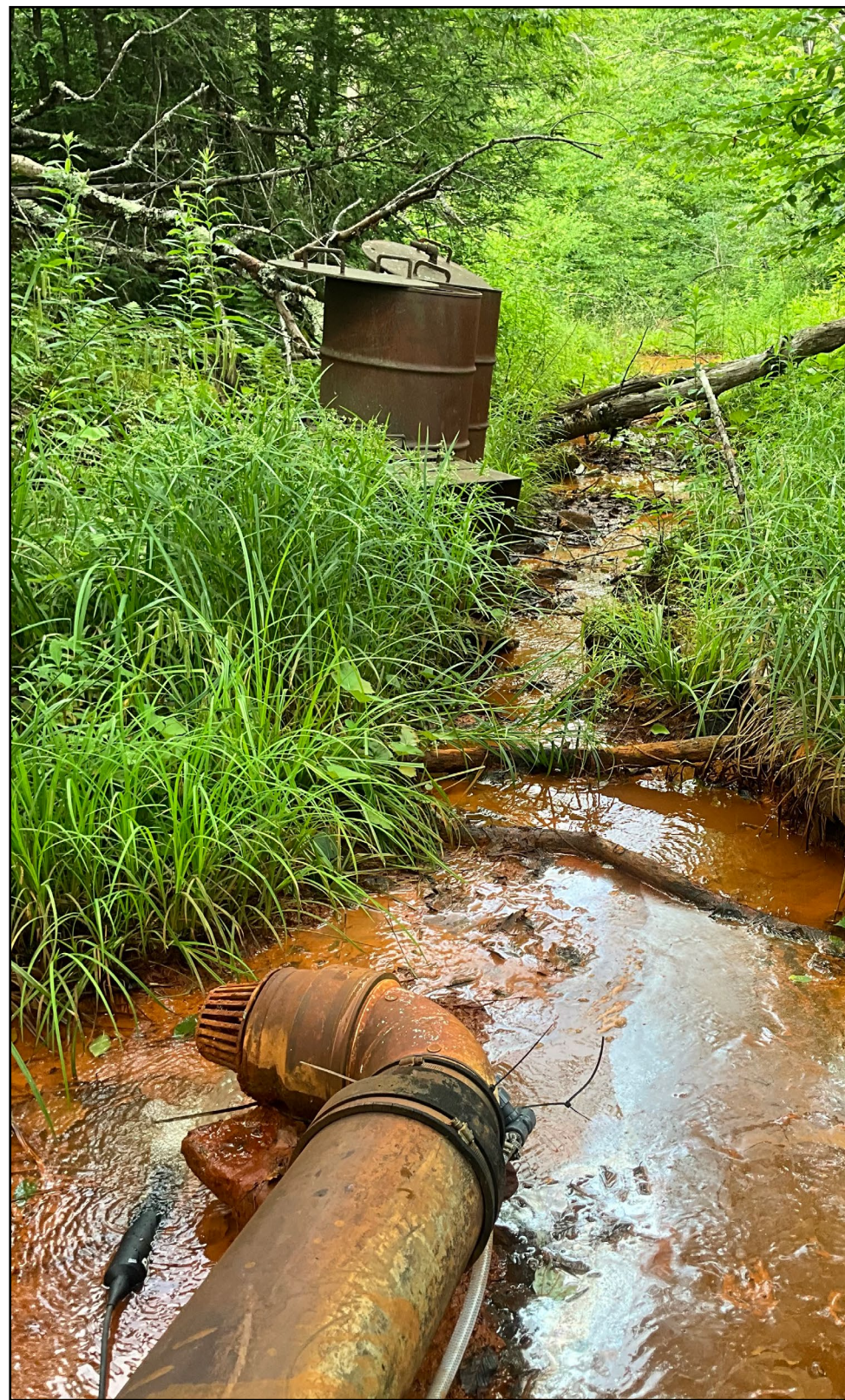
Permanent chemical treatment line attached to the deep mine's wet seal discharge pipe. This location drains to the headwaters of the South Fork Cherry River. Photo taken by the West Virginia Department of Environmental Protection during a citizen inspection of South Fork Coal Co.'s South Fork Deep Mine No. 2 on June 26, 2024.

WVHC remains committed to advocating for stringent oversight and regulatory enforcement to preserve the region's natural beauty and ecological integrity, and protect both humans and wildlife from the harms of coal mining pollution.